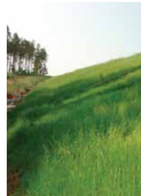
Effective immediately and grass grows twice as fast as blankets