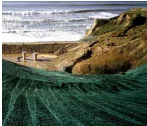
Less expensive than extended term blankets, and less soil preparation is required