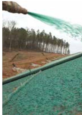
Same speed and cost-savings of other hydraulic applications, but lasts twice as long