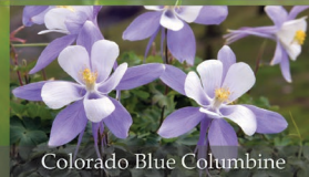
Colorado Blue Columbine