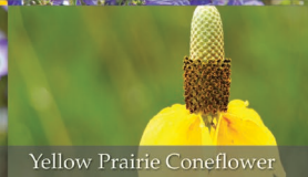
Yellow Prairie Coneflower