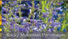
Rocky Mountain Penstemon