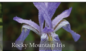
Rocky Mountain Iris